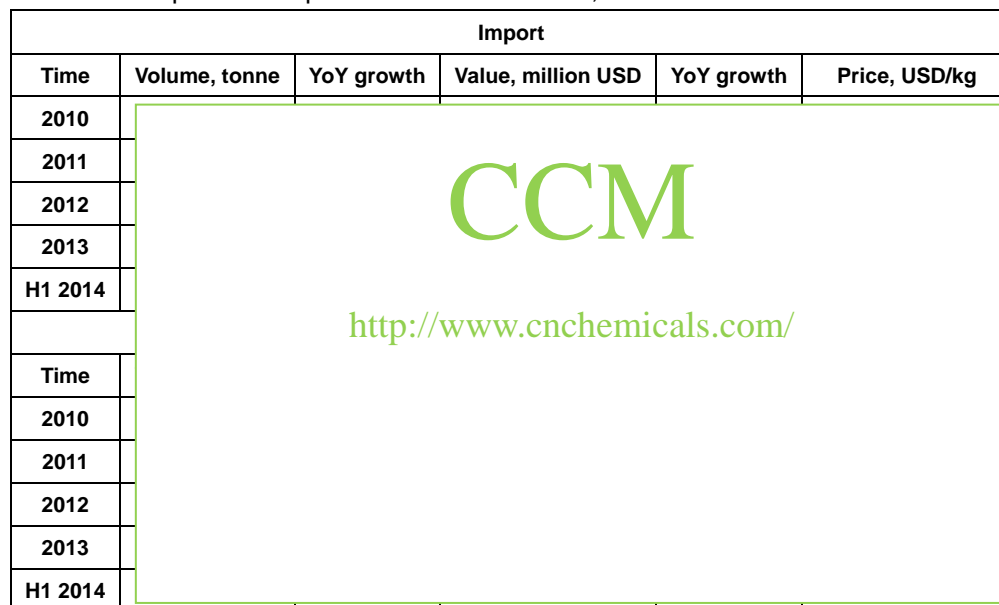
Table 2-1 Import and export of vitamins in China, 2010-H1 2014